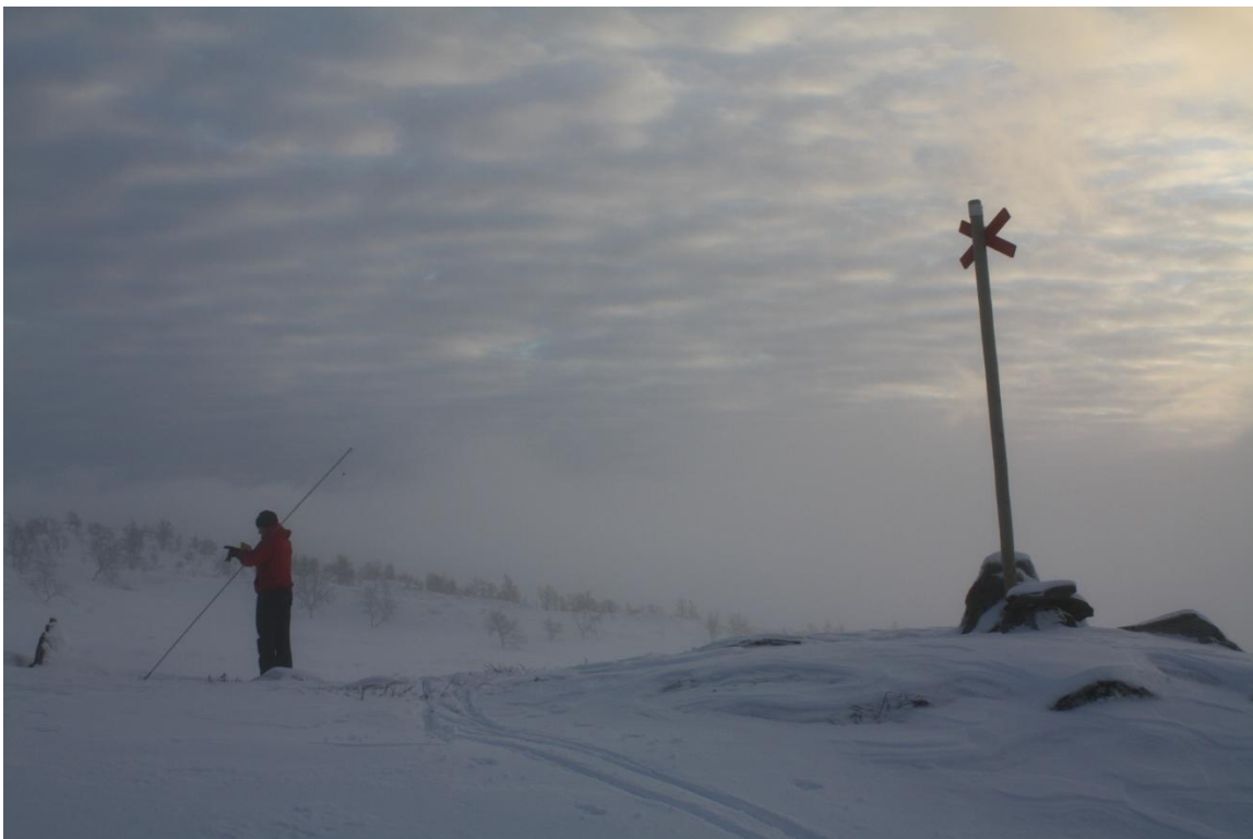
Snow depth measurements in Solberg, Hemavan in early January.

A significant number of projects are linked to Tarfala Research Station in the Kebnekaise massif where the department is running an extensive monitoring programme. Tarfala is used as a platform for both education and for national and international research programmes.