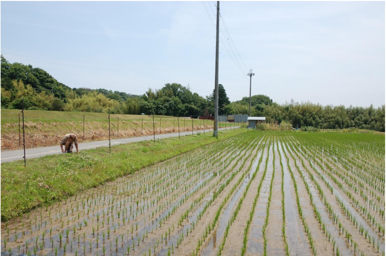
Plant survey of road verges in Japan. Collaboration with Kyoto University.

Université Pierre et Marie Curie, Paris, France