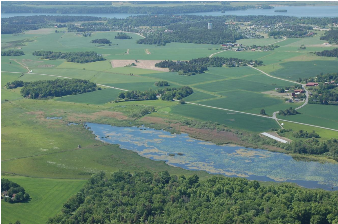
Wetland in agricultural landscape in Sörmland.

In this research, we use, develop and couple tools such as hydrological flow and solute-pollutant transport models, geographical information systems and remote sensing for both basic process quantifications and different applications.