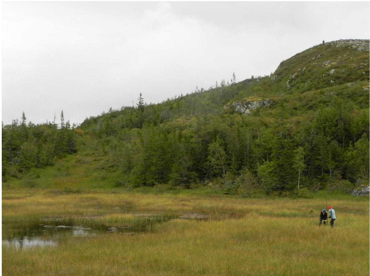
Coring at Fosenhalvøa, Norway.