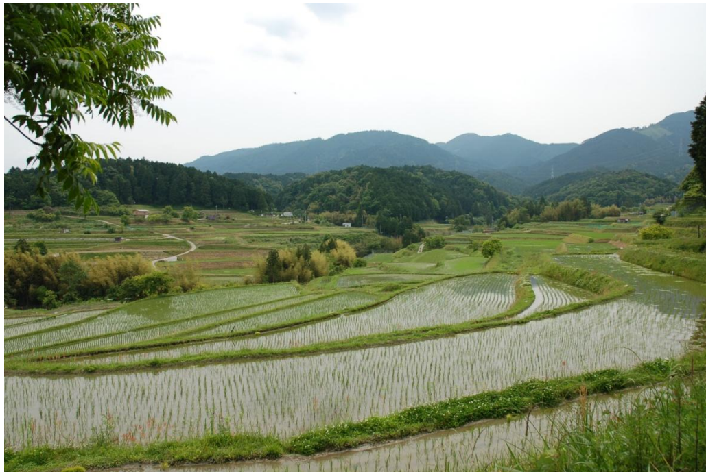
Traditionally managed paddy fields in Satoyama landscapes in Japan. Collaboration with Kyoto University.