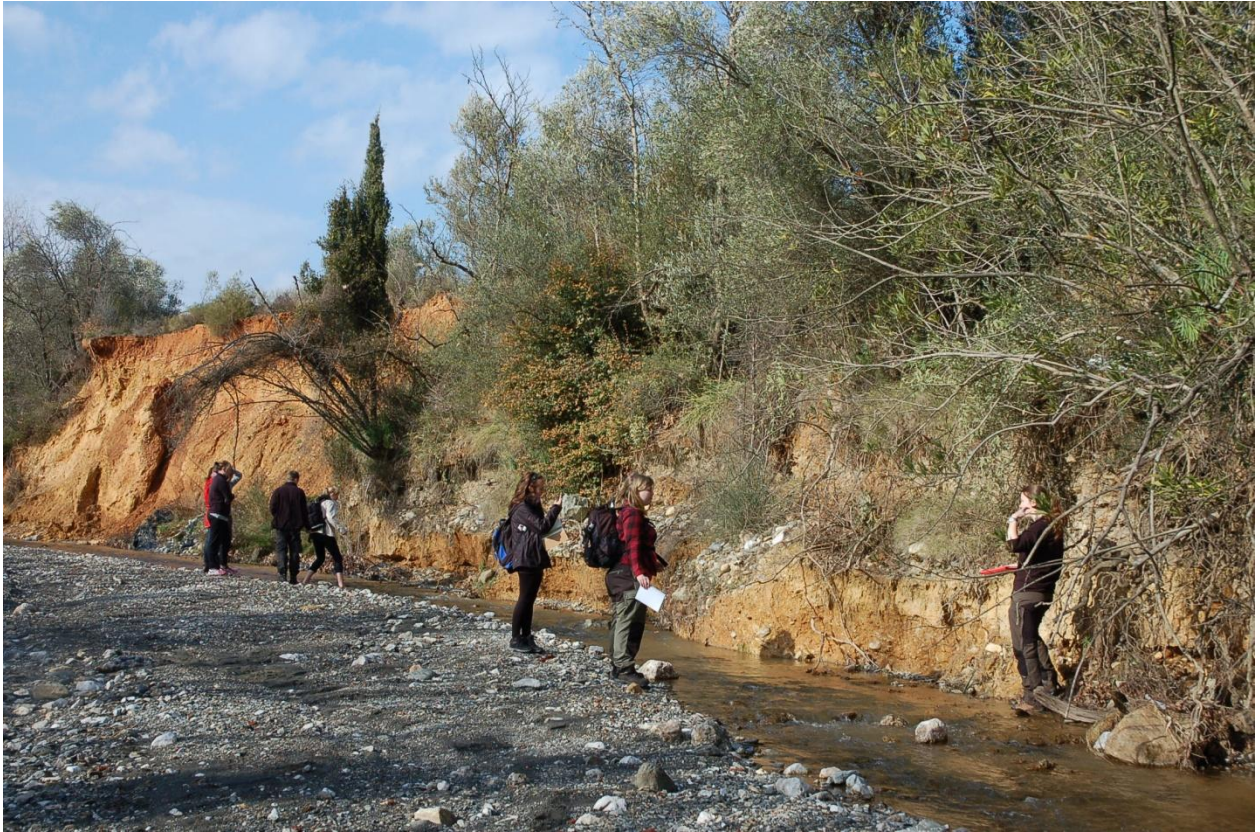
Students investigating an eroded river bed on the alluvial plain of Sparta, Greece.

The establishment of NEO is a very important step toward strengthening Swedish-Greek cooperation in the area of climate and environmental research. The operation of NEO presents a real example of how the academic community and the private sector can work together to focus on issues of great importance to society and nature.