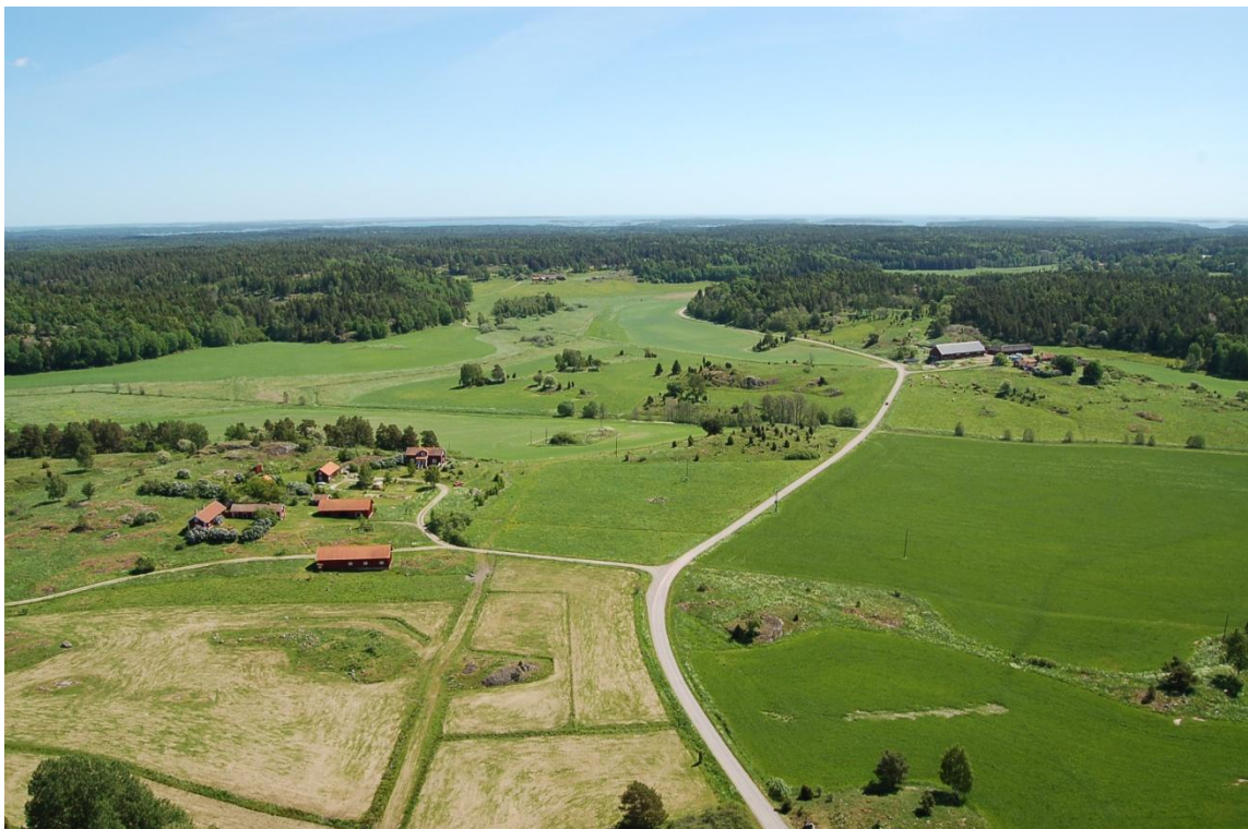
Traditionally managed pastures in Sörmland.

Meddelanden från Naturgeografiska institutionen, 1965-1994